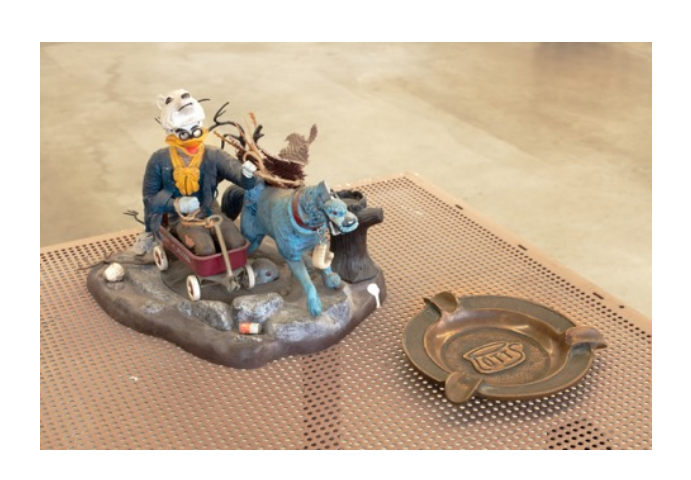
Radio Flyer Enamel on found model kit parts 1996