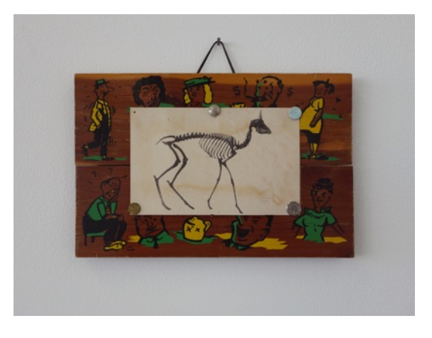
Funny Postcard Found postcard on found painted board 1998