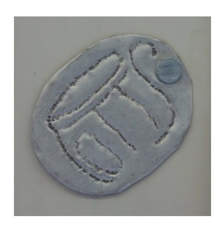
Potts dog tag Tooled aluminum 1975