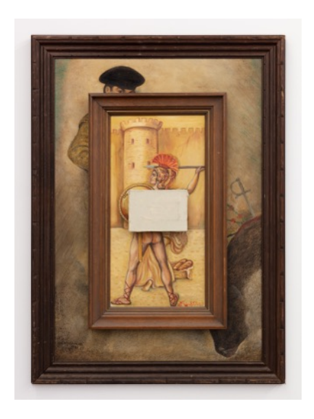
Thrift Store Matador Found paintings 1991