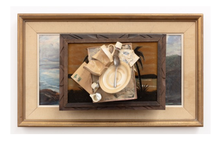
Coffee Break Acrylic, found paintings, found objects, 1992