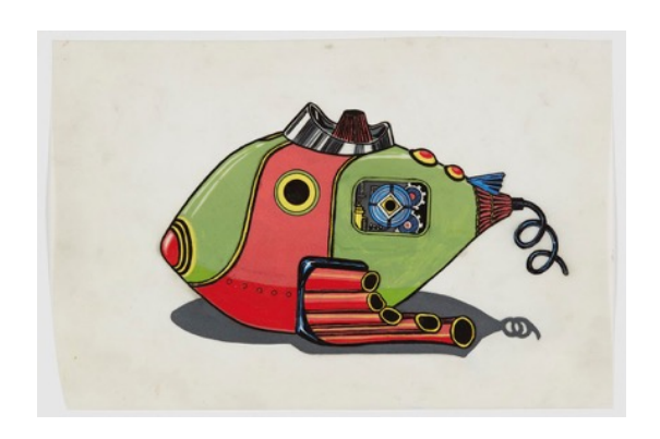
Fruits of Automation Ink and acrylic on vellum 1986