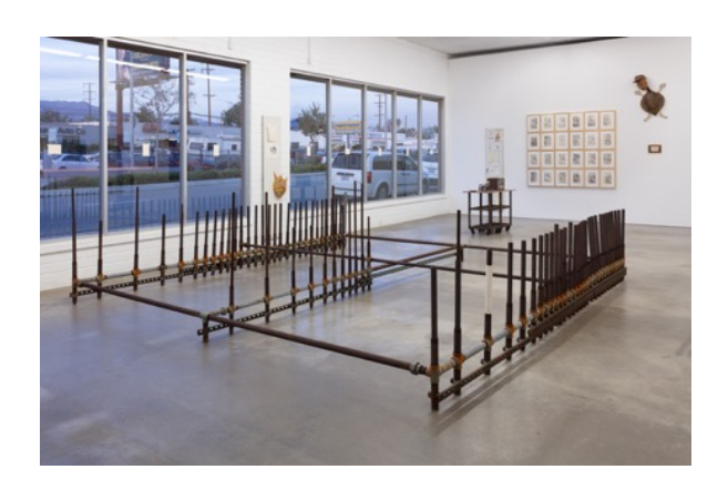
Untitled (pipe rack) Plumbing parts Date unknown