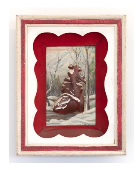
Valentine Object on found painting 1994