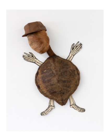
Untitled Turtle shell, burl, Halloween skeleton parts, pigskin cap 2005