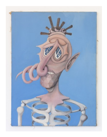
Untitled (skeleton torso) Acrylic on canvas 1976