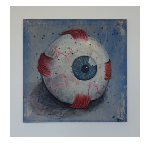
Eye Acrylic on canvas 1980

Anatomy of a Failure Ink on magazine 1984