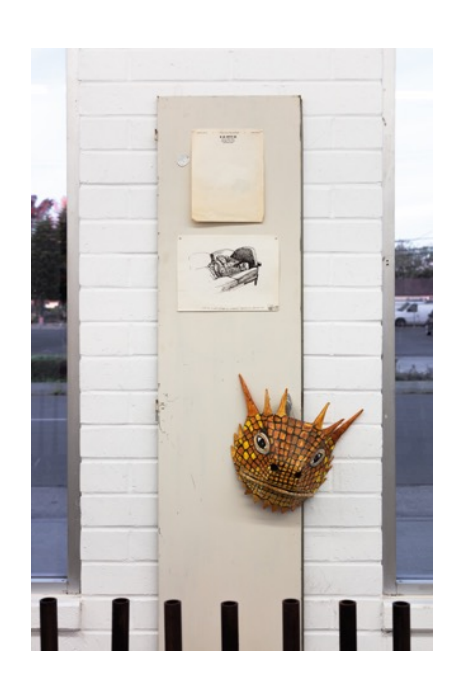
Horned Lizard Mask Acrylic on papier mâché 2018