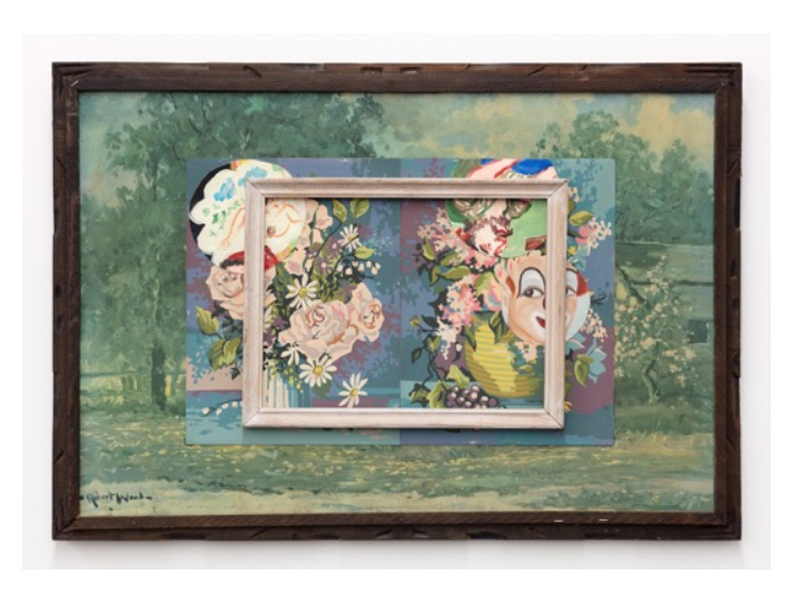
Thrift Store Clown Found paintings 1991