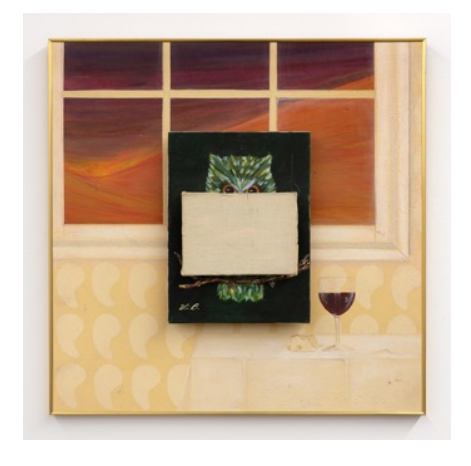
Thrift Store Owl Found paintings 1991