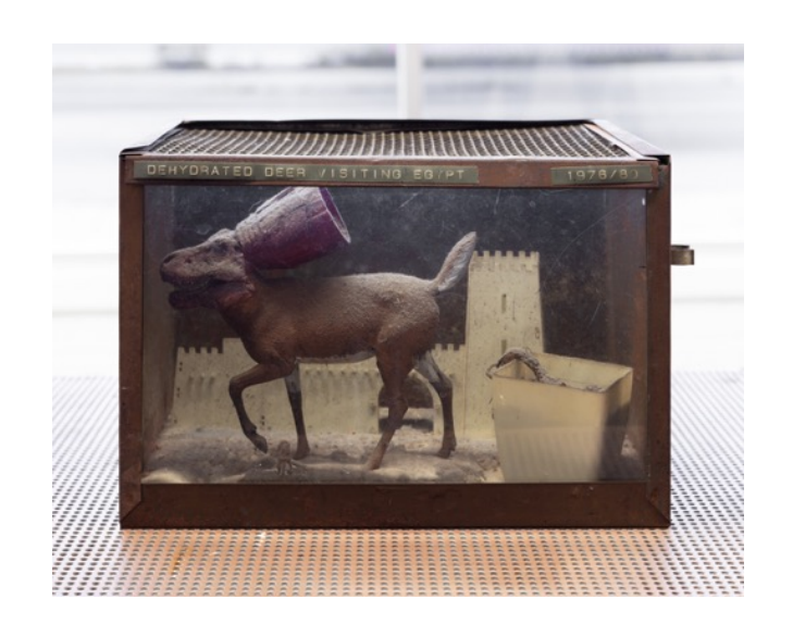
Dehydrated Deer Visiting Egypt Enamel on found model kit parts 1976/80