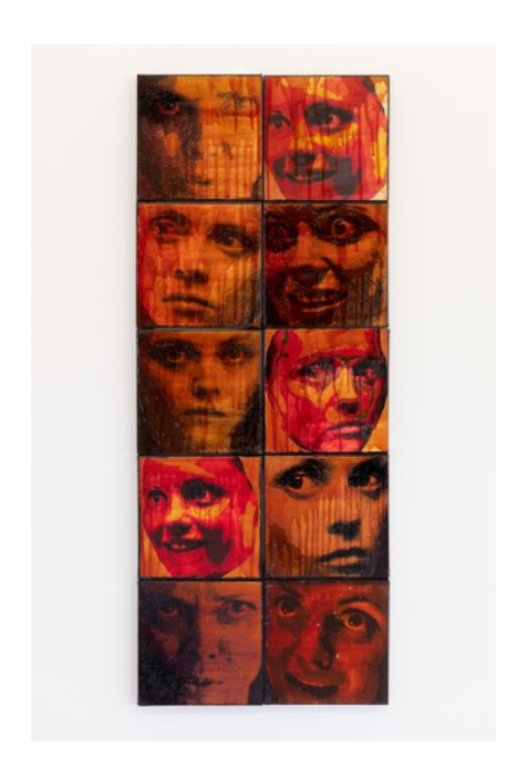
Mirror (Ricci) Shellac on acrylic on canvas mounted on panel, 10 count 2016