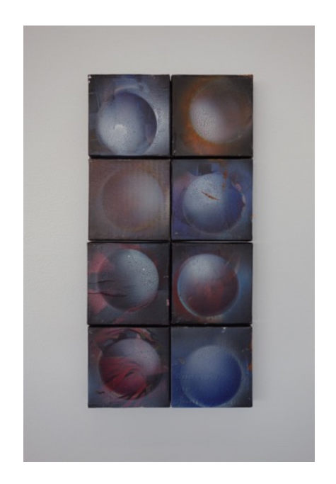
Potts Dots Acrylic on decal on canvas, 8 count 1994