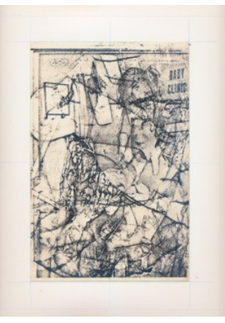
Daily Planet Photo Mechanical Transfer (PMT) on board, 24 count 1983