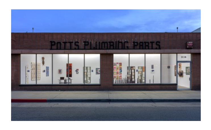
Potts Plumbing Parts sign Plumbing parts Date unknown