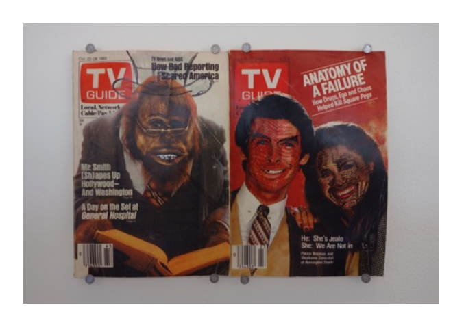
Mr. Smith Ink on magazine 1983

Anatomy of a Failure Ink on magazine 1984