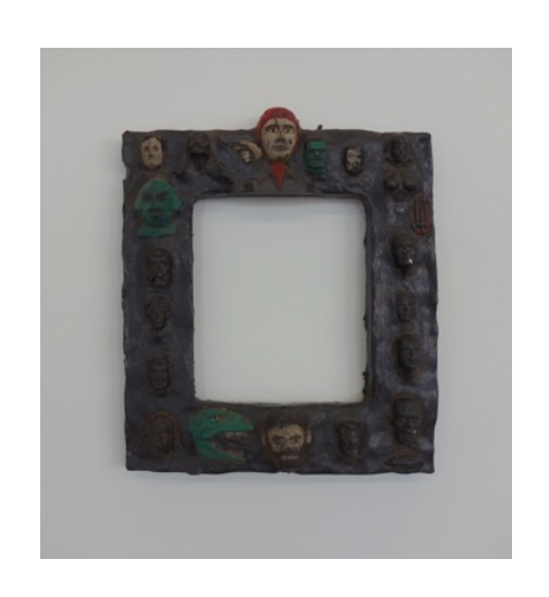
Framed Enamel on resin casting 1983